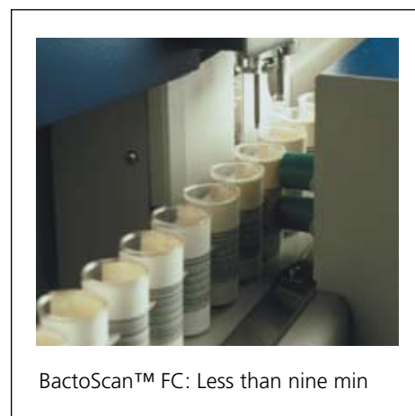
BactoScan™ FC: Less than nine min