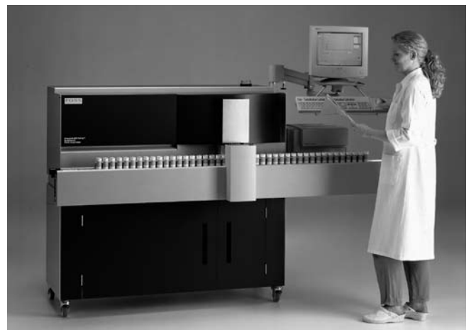
The BactoScan™ FC.